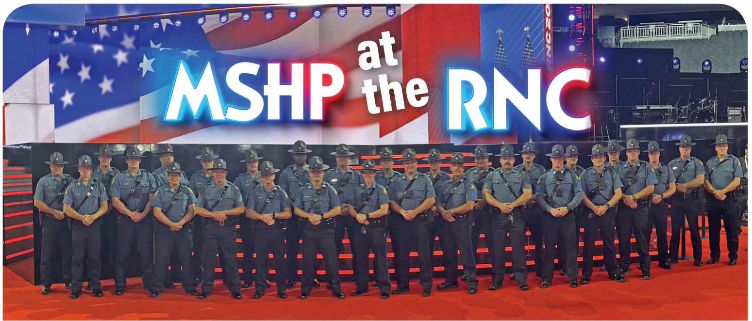
30 Troopers attended the 2024 Republican National Convention to help with security and crowd management. Law enforcement agencies from across the nation joined together to provide safety for this event.