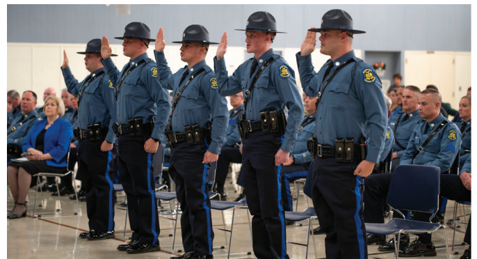
Members of the 119th Recruit Class say their oath and become troopers.