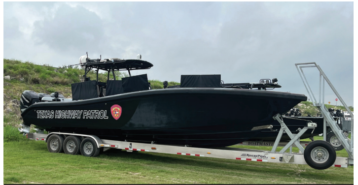
Marine-certified troopers joined the Texas DPS Tactical Marine Unit to familiarize themselves with DPS responsibilities on the Rio Grande River near Anzalduas Park.