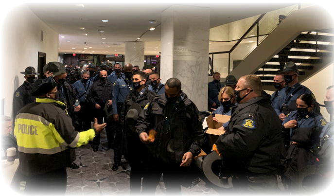
The Washington, D.C., Metro Police liaison briefed the MSHP detail on the first day of the assignment.