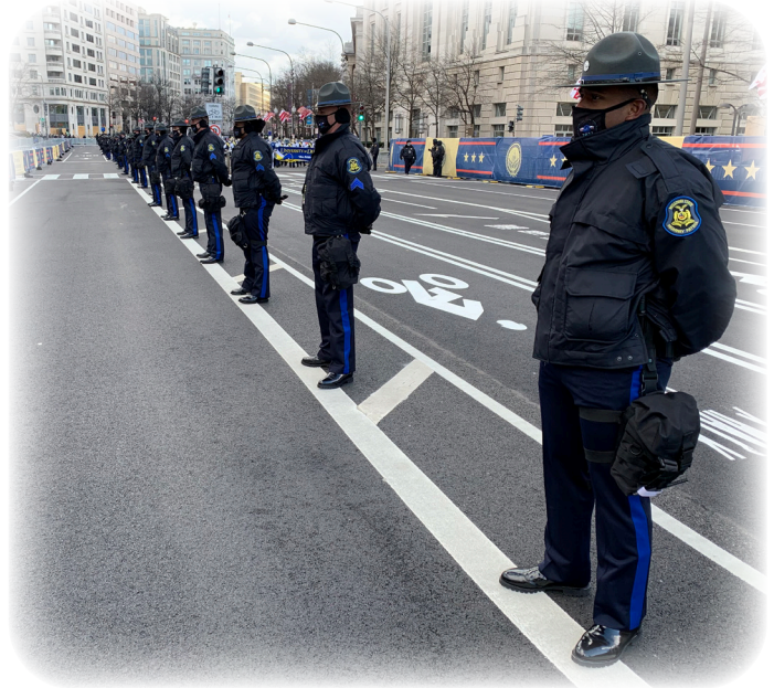
Members of the Patrol stand watch along the motorcade route in front of the press area.