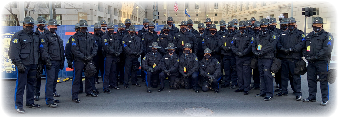
Every detail needs a group photograph!