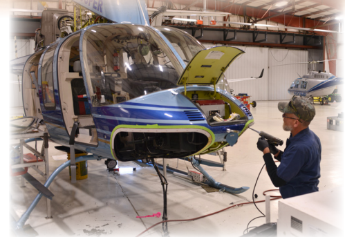
The Patrol's Bell 407 helicopter's inspection program is strict and detailed.

ing to travel to an aircraft's location when necessary to make repairs.