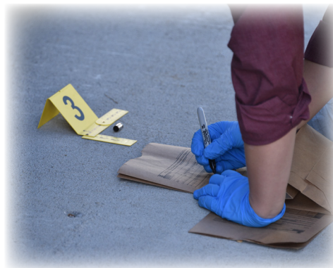
Evidence is processed and packaged during the 2018 Constitution Project.