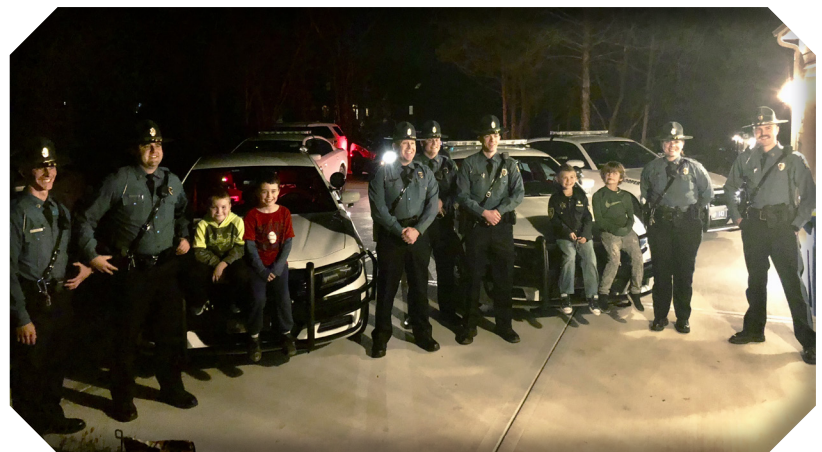
The birthday boy and some of his friends were happy to have their picture taken with this group of Kansas state troopers.