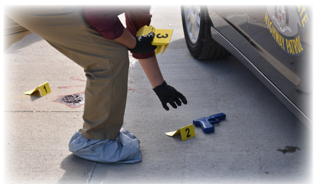
A student investigator marks evidence for photographing and collection.