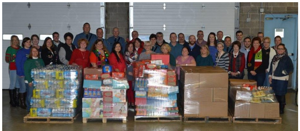
General headquarters Employees donated food to the Samaritan Center for Christmas.