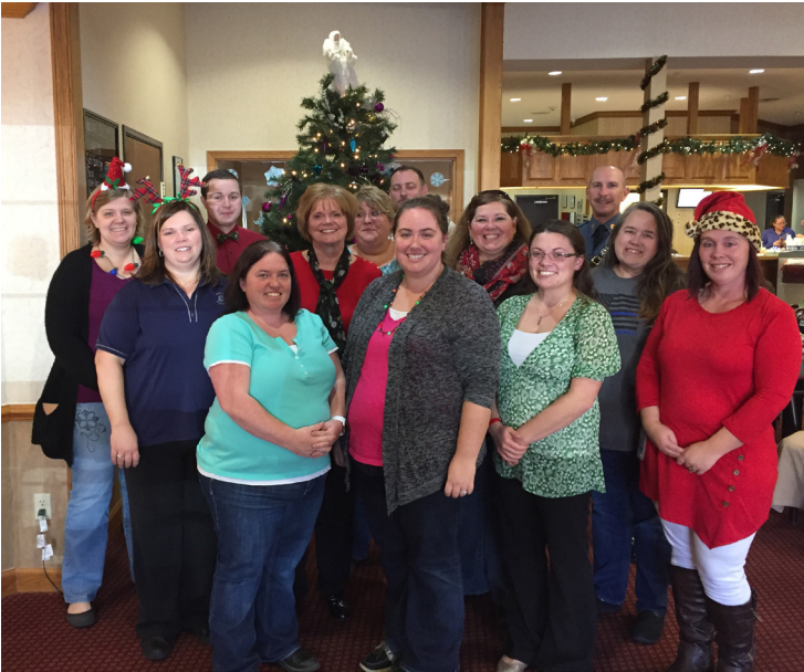
The 2017 Blue Notes Choir sang to residents at eight care facilities and employees attending the GHQ Christmas lunch.